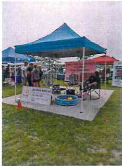
National Night Out

The Arc of Bay County • 709 Columbus Avenue • Bay City MI 48708 • SUMMER 2024