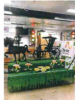
St. Patrick's Day Parade