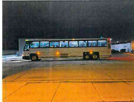
Our ride to Christmas at Camp Fish Tales